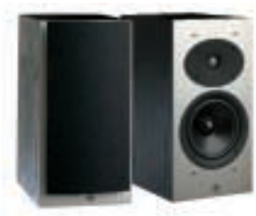
AS-B1 Bookshelf Speakers